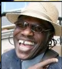
Joe Louis Walker