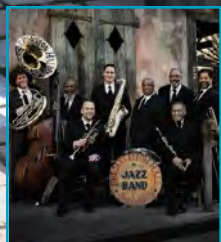
Preservation Hall Jazz Band