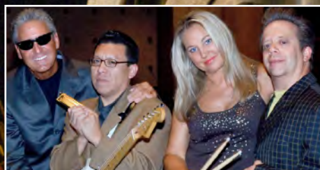
Rod Piazza & The Mighty Flyers