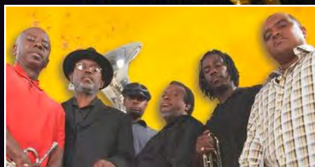
Dirty Dozen Brass Band