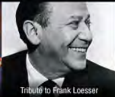
Tribute to Frank Loesser