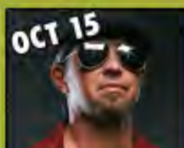
JP SOARS and THE RED HOTS