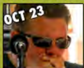
BIG VINCE and THE FAT CATS

Costume contests, raffles & drink specials all 3 days!