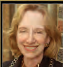
DORIS KEARNS GOODWIN Presidential Historian