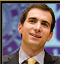
ANDREW ROSS SORKIN Author and Journalist: "Too Big To Fail"

FESTIVALOFTHEARTSBOCA.ORG • Call for info: 561-368-8445