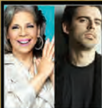
An Evening of Gershwin PATTI AUSTIN and TONY DESARE