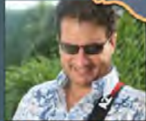
FEB 5 SUPERBOWL SUNDAY with AZ KENNY & 56 DELUXE