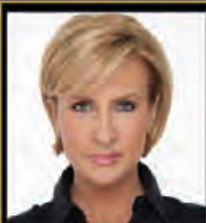
MIKA BRZEZINSKI Author and Journalist: "Knowing Your Value"