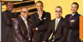
RAMSEY LEWIS' ELECTRIC BAND