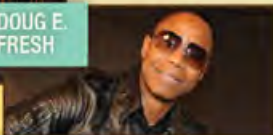
DOUG E. FRESH