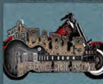
MAY 25-26-27 EARL'S FEST 2013

1405 INDIAN RIVER DRIVE, SEBASTIAN (772) 589-5700 www.earlshideaway.com OPEN 7AM 7 DAYS A WEEK LIVE ENTERTAINMENT • GREAT FOOD FULL LIQUOR LOUNGE • PACKAGE STORE YOU CAN'T BEAT THE FEELING AT EARL'S!