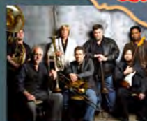
MAY 5 MINGO FISHTRAP