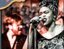
OCTOBER 13 NIKKI HILL & MATT HILL BAND