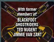
OCTOBER 27 ROCK LEGENDS BAND

1405 INDIAN RIVER DRIVE, SEBASTIAN (772) 589-5700 www.earlshideaway.com OPEN 7AM 7 DAYS A WEEK