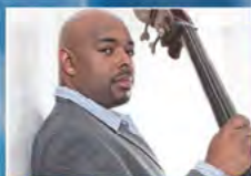
JUNE 14, 2014 CHRISTIAN MCBRIDE TRIO