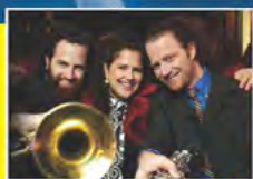
NOVEMBER 16, 2013 3 COHENS SEXTET