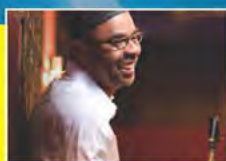
JANUARY 11, 2014 KENNY GARRETT QUINTET