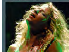
OCTOBER 20 ANA POPOVIC