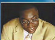
DECEMBER 14, 2013 CYRUS CHESTNUT TRIO with Russell Malone