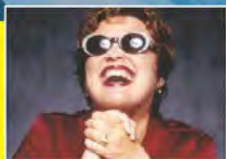
MAY 10, 2014 DIANE SCHUUR