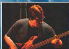
FEBRUARY 8, 2014 JEFF BERLIN TRIO