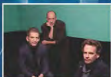
APRIL 12, 2014 BRAD MEHLDAU TRIO