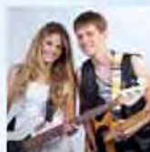
IN LAYMAN TERMS BETWEEN SETS