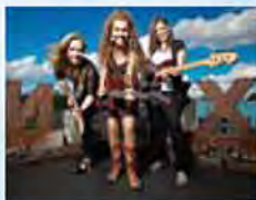
GIRLS WITH GUITARS