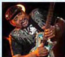
SUPER CHIKAN AND THE FIGHTING COCKS