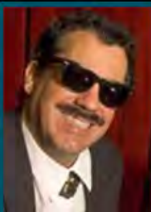
Friday 08/21 | 8pm Barrelhouse Chuck Blues