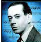
July 20 COLE PORTER TRIBUTE