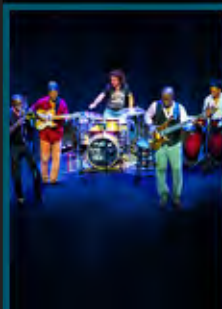
Saturday 08/01 | 8pm Oriente Latin Jazz