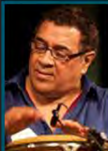
Friday 07/10 | 8pm Sammy Figueroa Latin Jazz