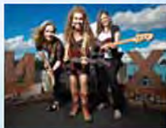
GIRLS WITH GUITARS