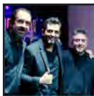
July 6 SOUND OF VISION