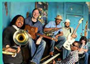
Ghost Town Blues Band