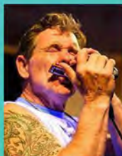
Little Mike & The Tornadoes