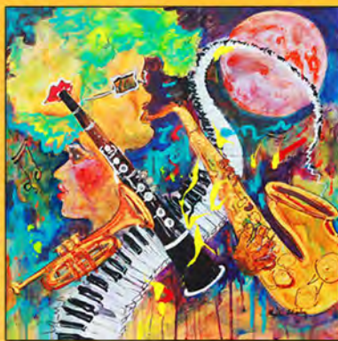
"IT'S JAZZ TIME" BY PHYLLIS SHIPLEY OF ROCKLEDGE, FL