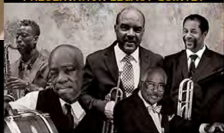
PRESERVATION LEGACY QUINTET