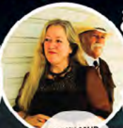
LUCKY MUD High Springs Fire Dept 2-3 PM