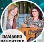
DAMAGED DAUGHTERS Great Outdoors 5-6 PM