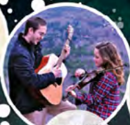
WELL WORN SOLES High Springs Library 3-4 PM