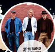
2PM BAND High Springs Museum 1-2 PM