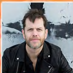
FEBRUARY 16 DONNY MCCASLIN QUARTET