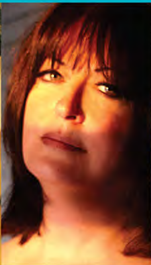
ANN HAMPTON CALLAWAY