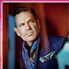
MAY 18 KURT ELLING QUINTET