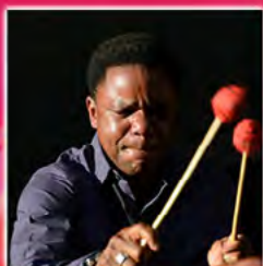
APRIL 20 STEFON HARRIS & BLACKOUT