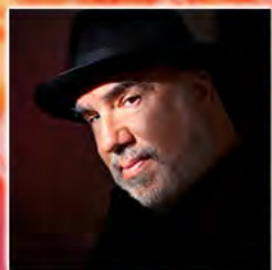
JANUARY 18 RANDY BRECKER QUINTET