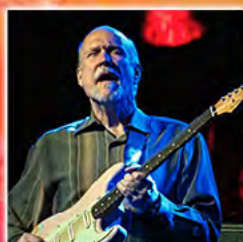
MARCH 16 JOHN SCOFIELD'S COMBO 66